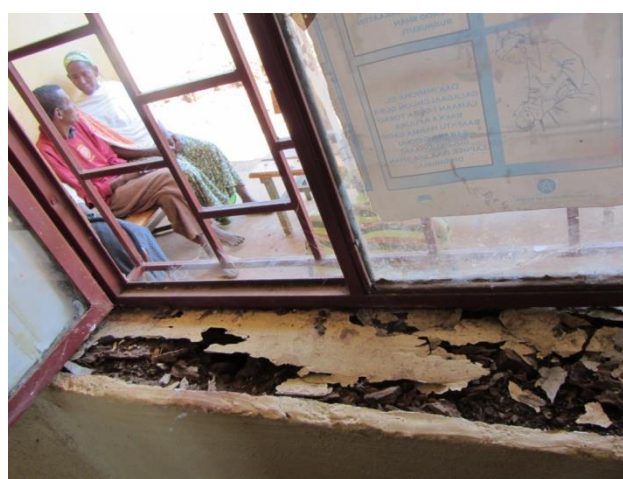
Termite activity and destruction of newly built health station in Bikila